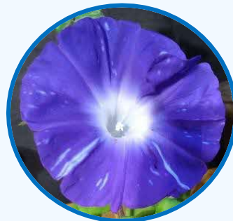
Higo Morning Glory