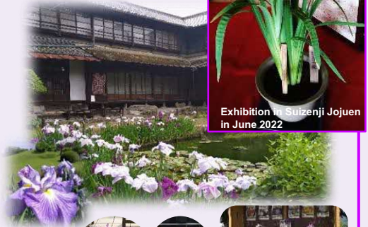
Exhibition at Suizenji Jojuen in June 2022

Irises are also planted in Suizenji Jojuen Garden, Kumamoto City Zoological and Botanical Gardens and Higo-Hosokawa Garden in Tokyo.