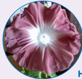
Higo Morning Glory