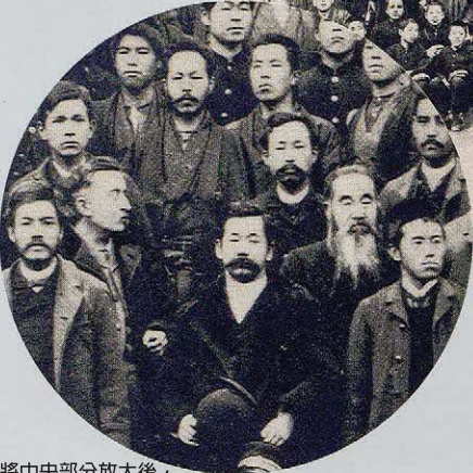
將中央部分放大後， Hearn與秋月胤永分別在嘉納治五郎的左邊和右邊 Magnified portion of the photograph shows Kano (center) flanked by Hearn (left) and Akizuki (right)