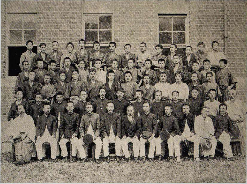
五高畢業紀念照，Hearn為前排右起第二位（白衣） Graduating class of the Fifth Higher Middle School. Hearn is in the front row, second from the right.