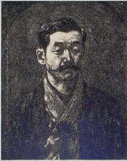
嘉納治五郎為 Hearn任職時的校長（第3任） Kano Jigoro, third Director

Hearn's colleagues at the Fifth Higher Middle School